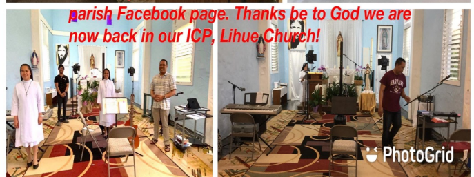
parish Facebook page. Thanks be to God we are now back in our ICP, Lihue Church!