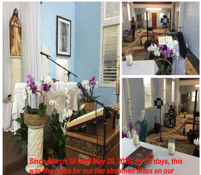
Since March 18 until May 29, 2020, for 73 days, this was the place for our live streamed Mass on our

"Before Christ's coming, faith in the Trinity lay hidden in the faith of the learned, but through Christ and the apostles it was shown to the world." (St. Thomas Aquinas)